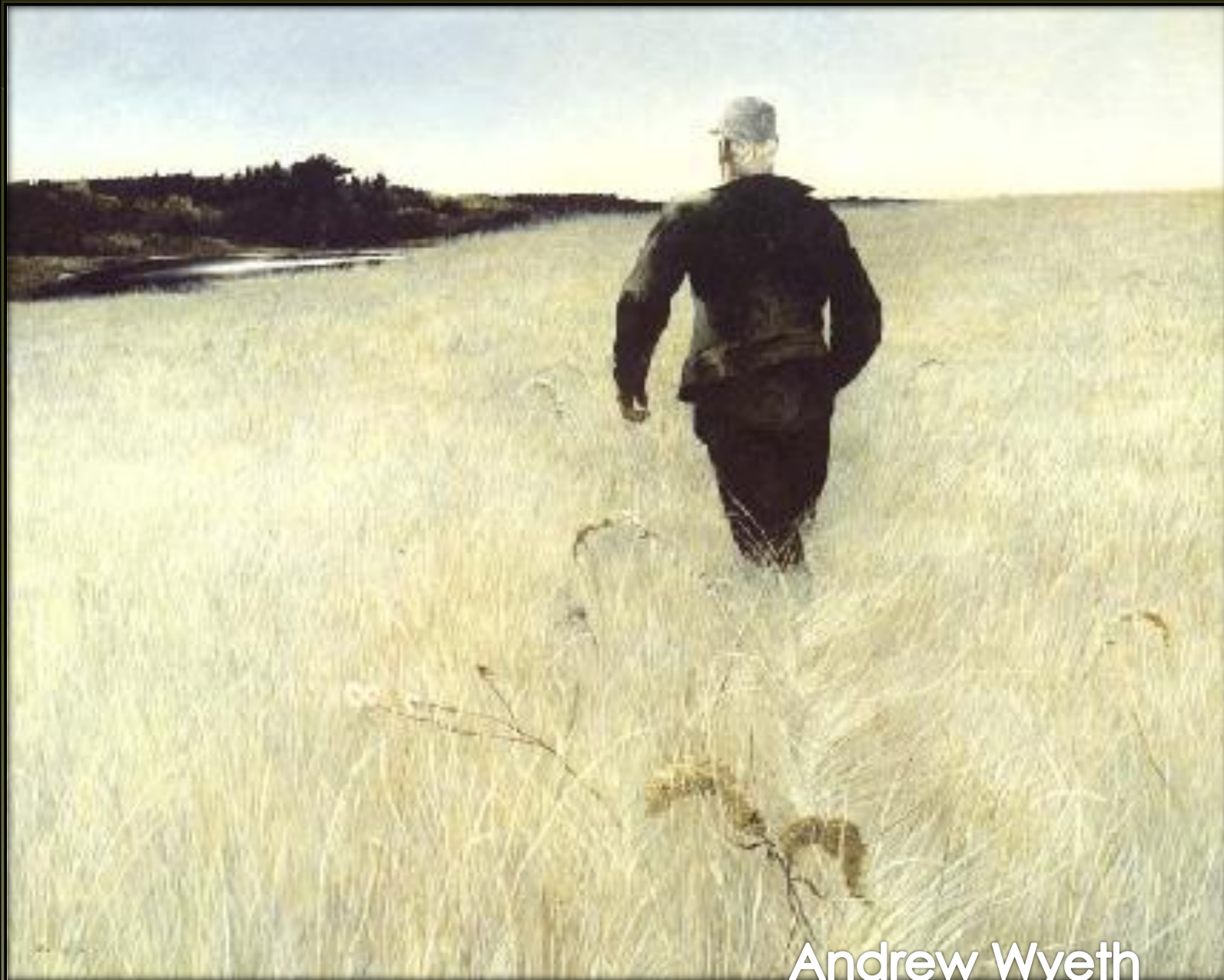
Andrew Wyeth Turkey Pond, 1944