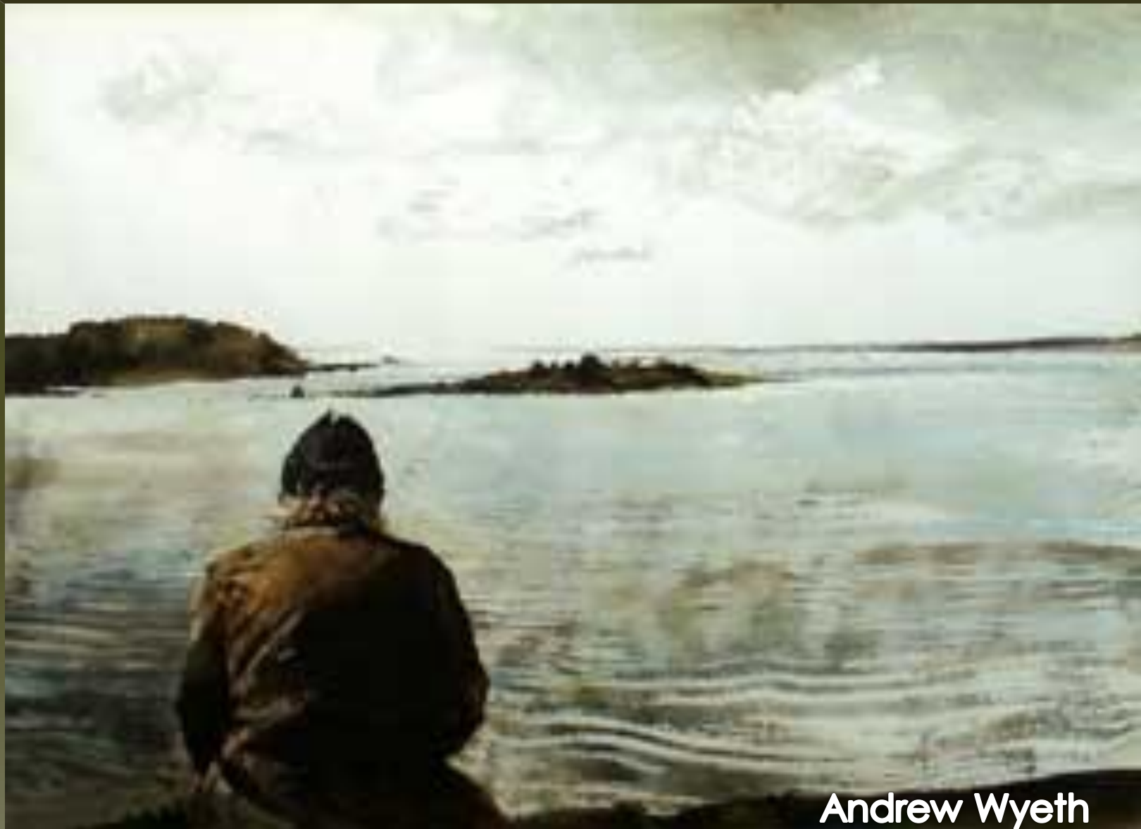
Andrew Wyeth Baleen, 1982