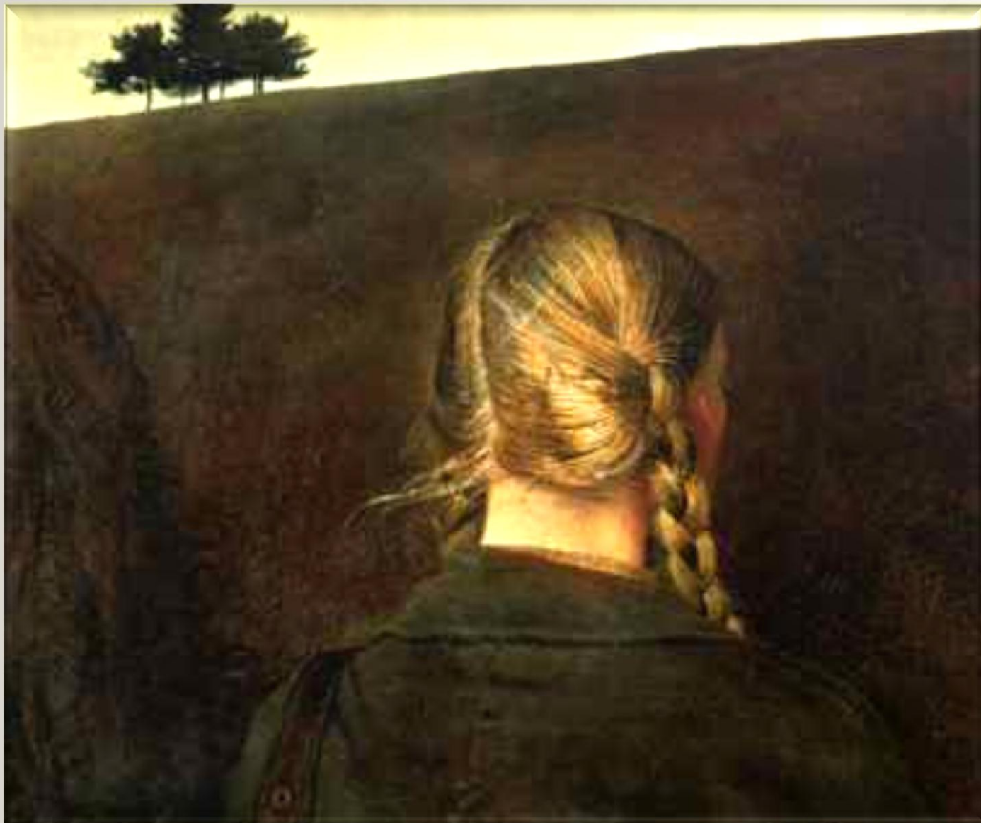
Andrew Wyeth Farm Road, 1979