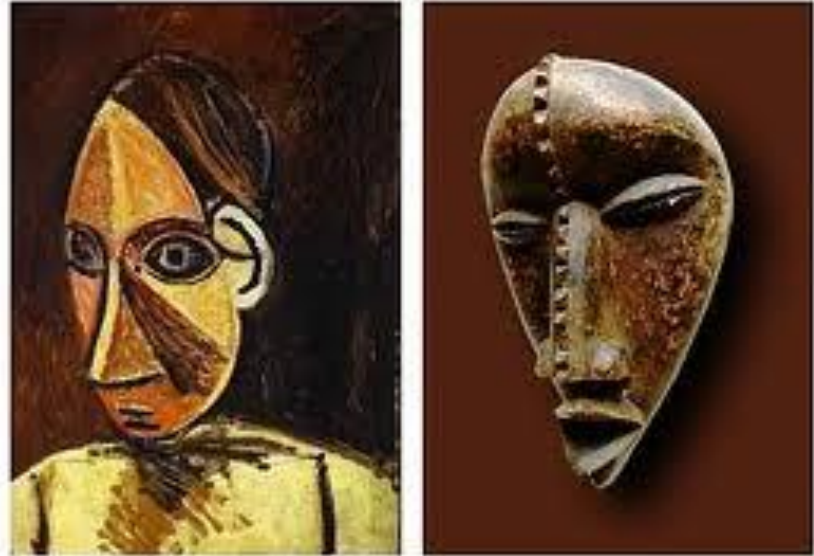
Head of a Woman (1907)