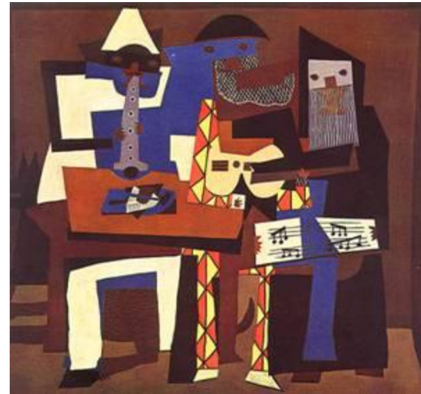
Three Musicians (1921)

Focus on geometric shapes, not realistic images