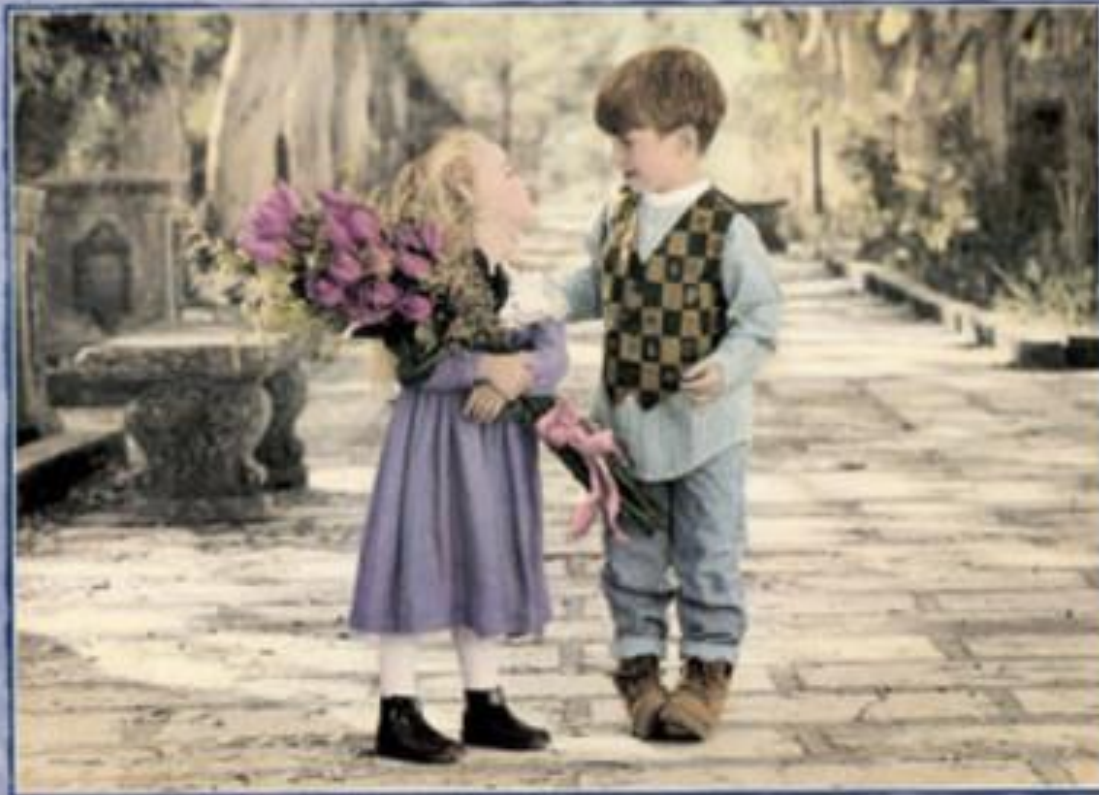
Little Romance