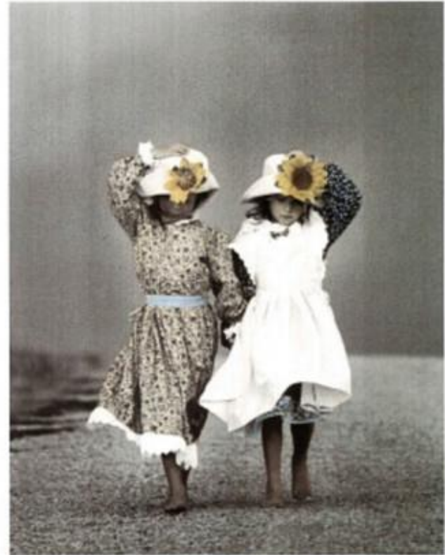
Best of Friends